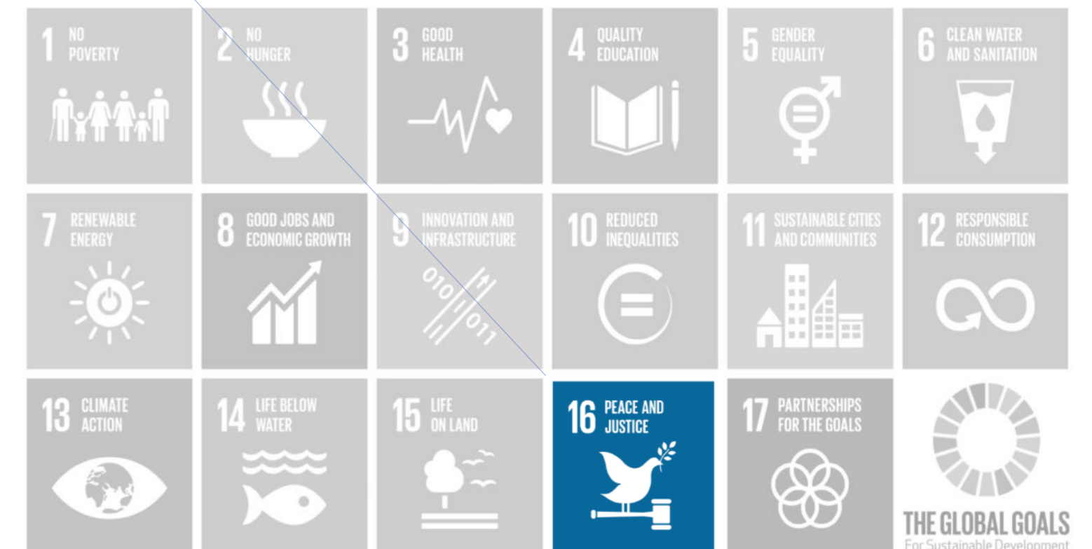
Areas of Focus (The Rotary Foundation)