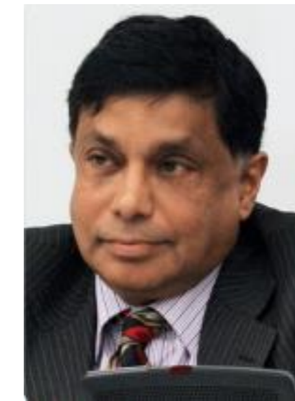
Ramu Damodaran United Nations