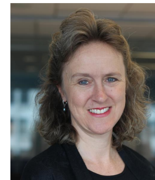
Zarrin Caldwell U.S. Department of State